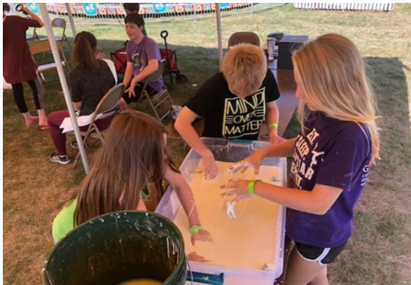
4-H Experimentation Station for county youth at the Mason County Fair.