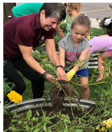
Hands-on learning during the planting phase of MSU Extension's "Eat A Rainbow" program.