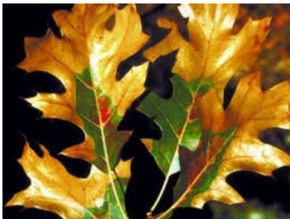
One of the many plant disease samples brought into the Extension office for identification.