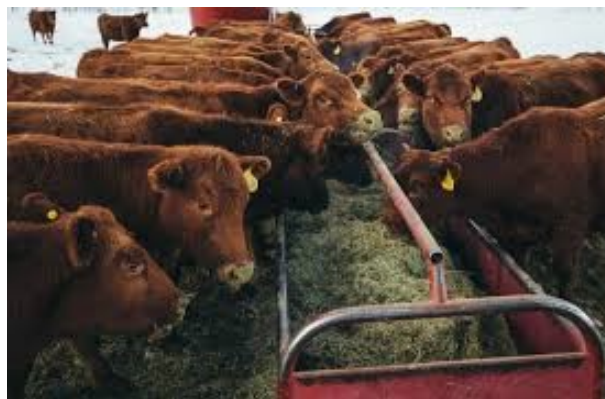
Beef and dairy farms benefitted from consultation visits from MSU Extension educators

Providing support to dairy and beef farms in Mason County resulted in improved quality of livestock, savings on investment in feed, and time-saving efficiencies, all of which result in better financial performance. Other farm visits in Mason County focused on succession planning with farm financial analysis, Farm Bill education sessions, and Farm Stress consultations.