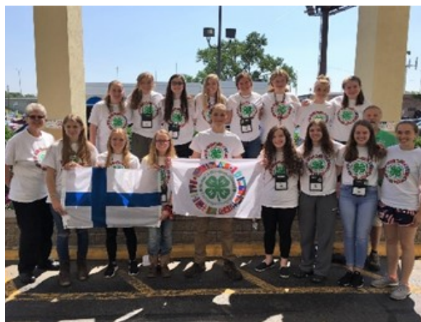
Delegates from Costa Rica, Norway, Korea and Taiwan.

Helping young people to explore and to appreciate what people around the world have in common and what makes them unique is critically important in society today. Michigan 4-H offers a variety of opportunities for kids and adults to learn more about our global community. In Mason County, multiple families participated in the role of international exchange host, sharing cultural experiences with students from Japan, Costa Rica, Korea, and Taiwan.