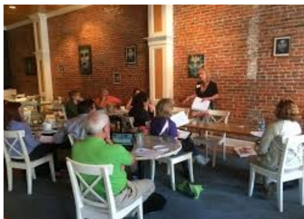
The Citizen Planner Program covers the fundamentals of planning and zoning.

Providing education and technical support to help create successful commissions and teams is the foundation of the work of MSU Extension's Government and Public Policy Educators. Mason County residents participated in New County Commissioner training, Ballot Proposal Education, Citizen Planner training, Planning & Zoning for Solar Energy Development training, and various webinars.