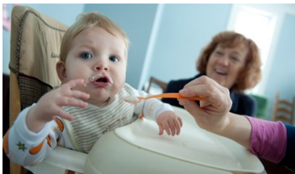
Children from birth to age 8 benefit from support to parents and care givers.